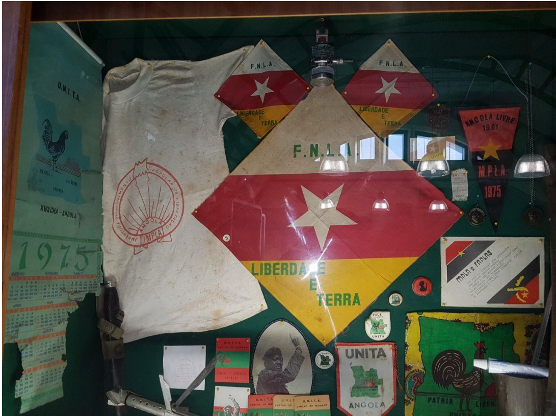
Dedicated to the Liberation struggle in Angola.