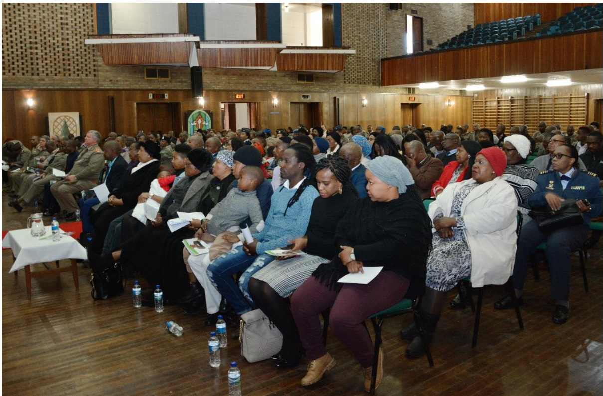
Hall setup overview.