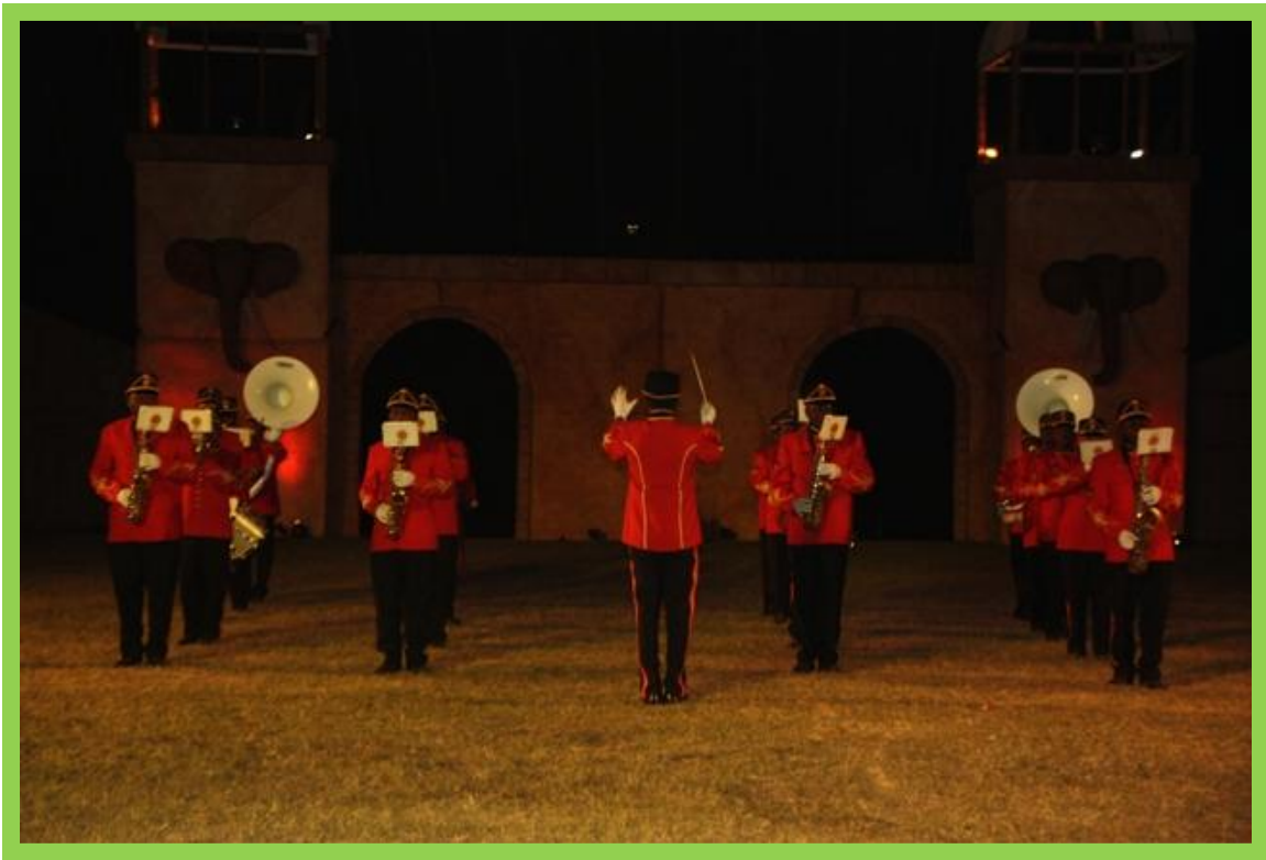
SA Army Band Limpopo playing during the 2013 KZN Military Tattoo