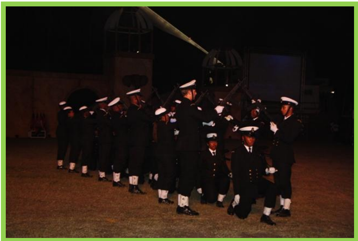
Naval Station Durban Precision Drill Squad performing during the 2013 KZN Military Tattoo