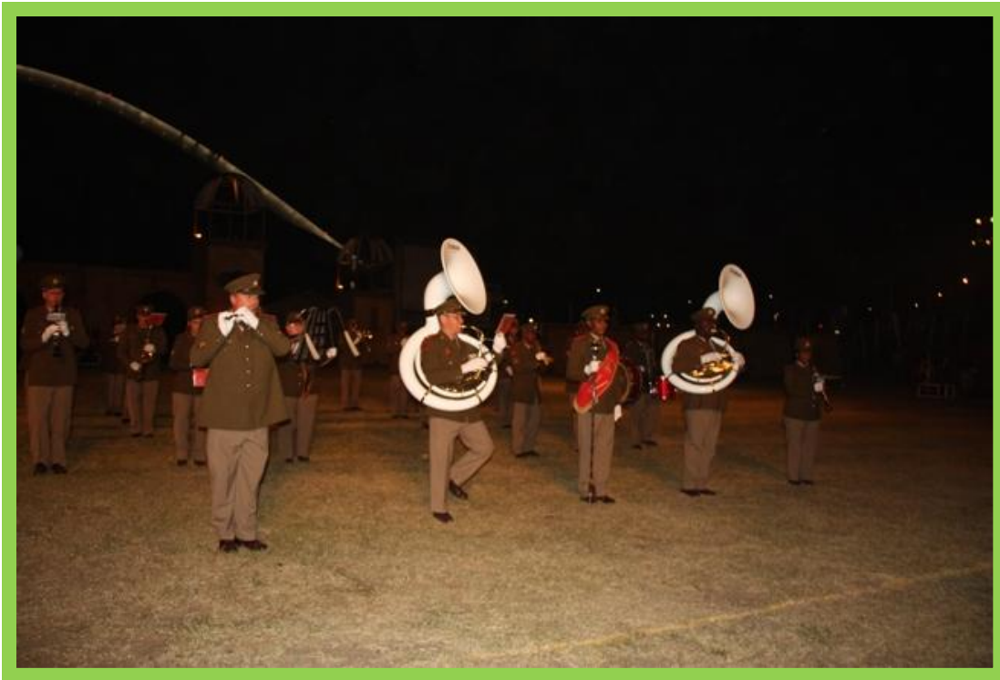
SA Army Band Kroonstad playing during the 2013 KZN Military Tattoo