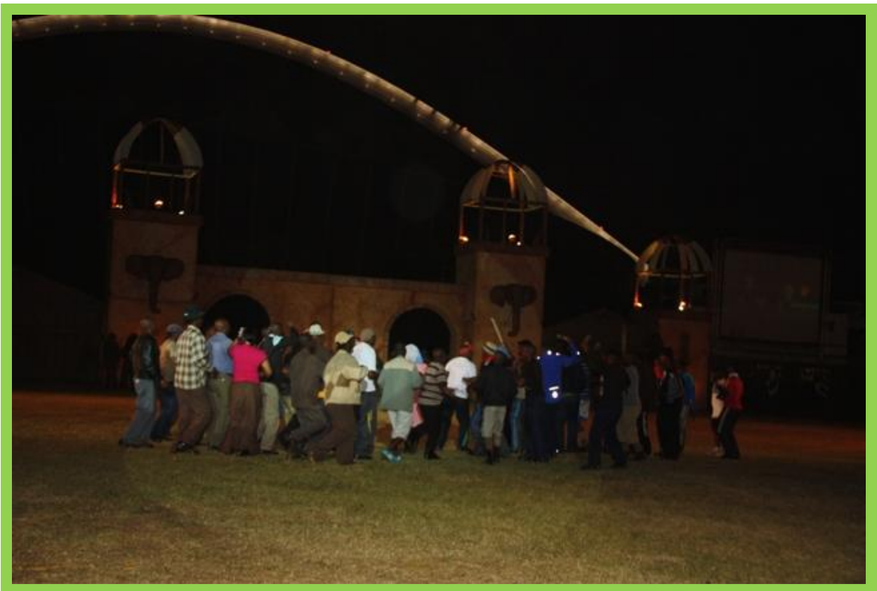
Crowd control re-enactment during the 2013 KZN Military Tattoo