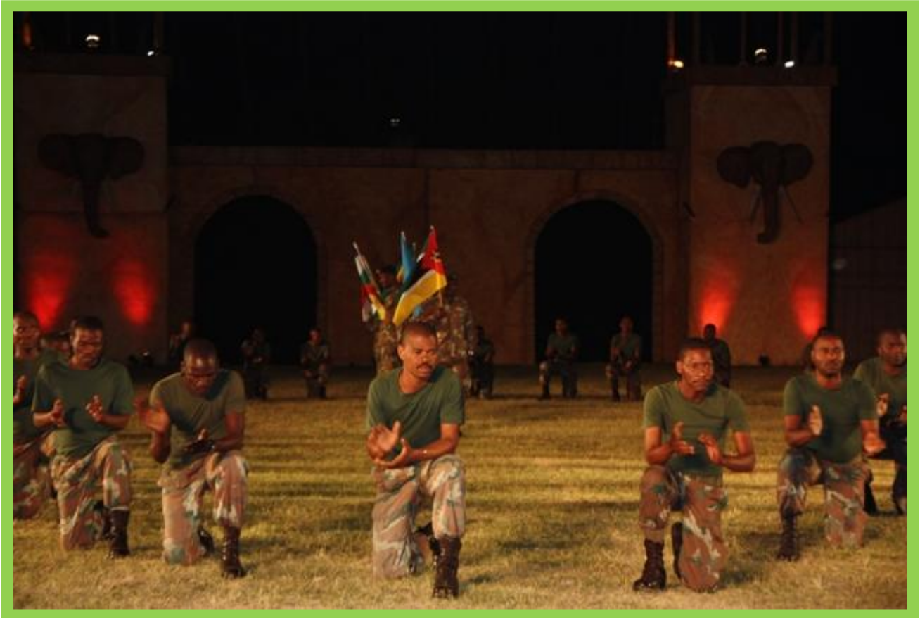
African Co-operation dance during the 2013 KZN Military Tattoo