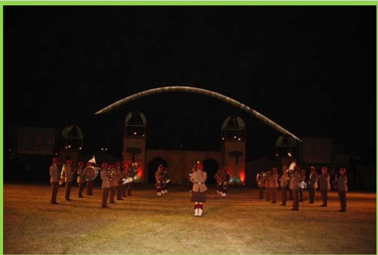
South African Military Health Service Band playing in harmony during the 2013 KZN Military Tattoo