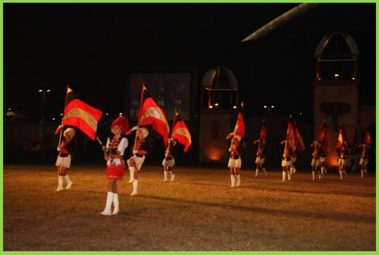
Durban Girls High School Drummies in action