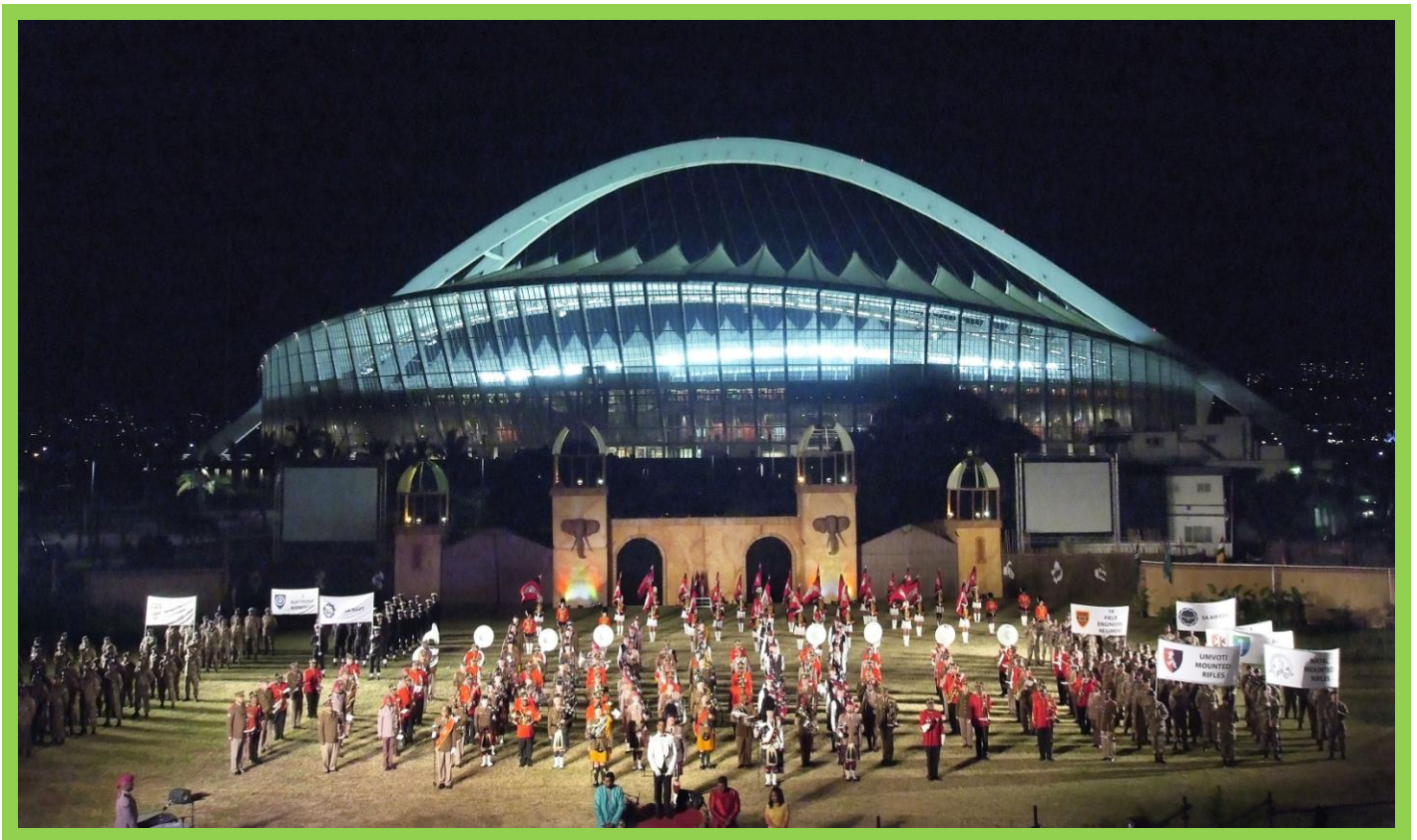
The finale with the massed bands in action led by Lieutenant Colonel Gerald Seekola