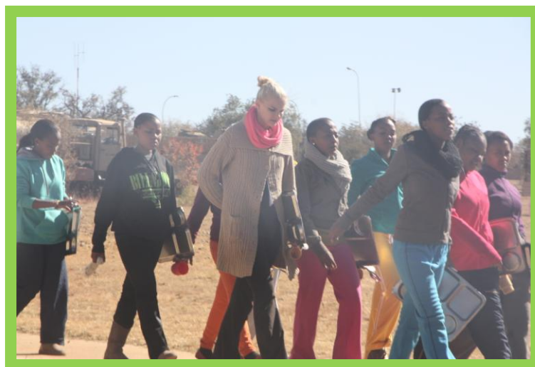
The females will not be left behind