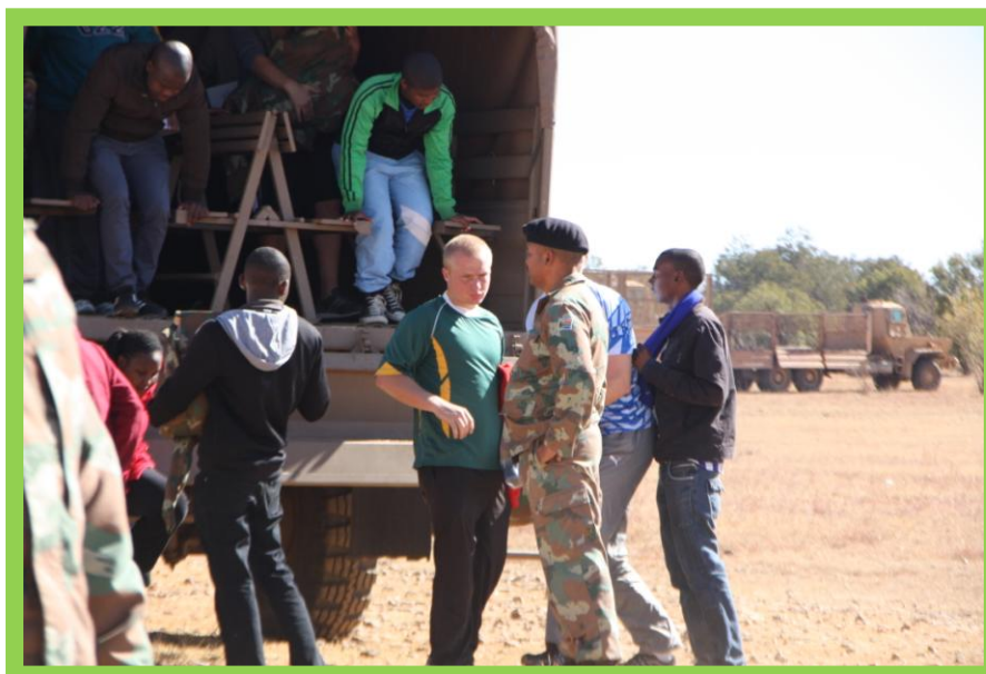
Time for the kit issue

The photographs below reflect the first few days of the recruits in their new environment.