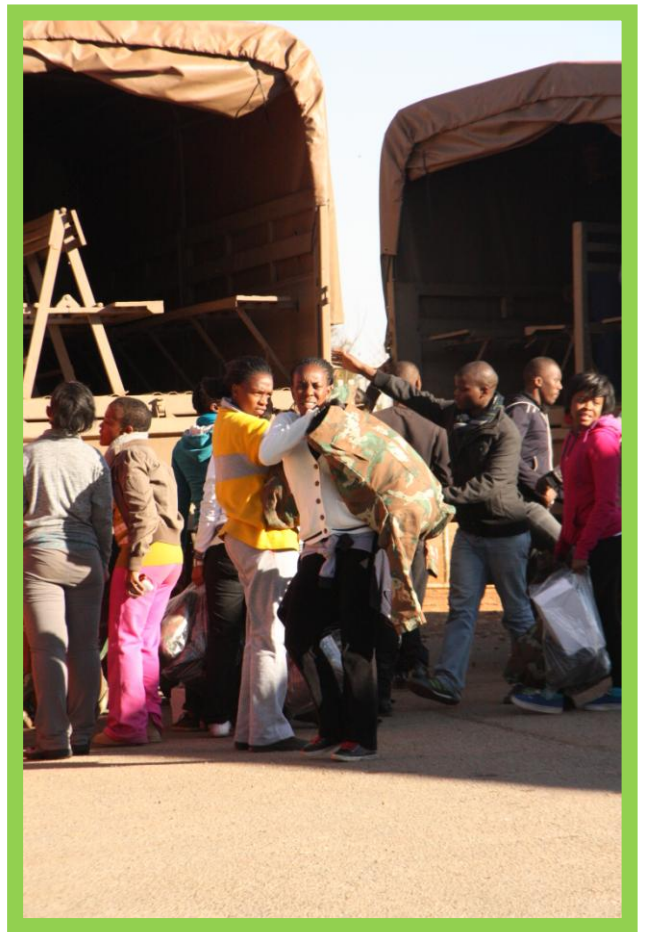
Getting used to a new form of transport