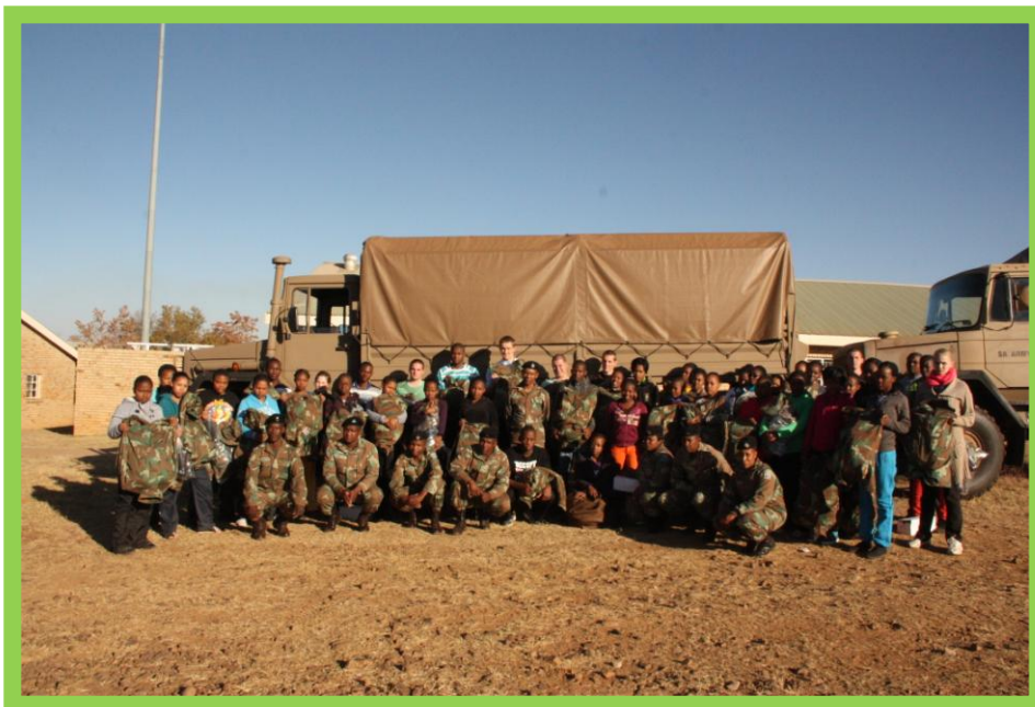
A new experience waiting for these patriotic future leaders!