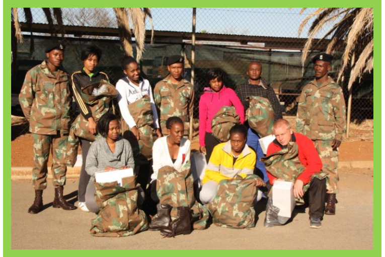
Ready to change from civilian to camouflage clothing