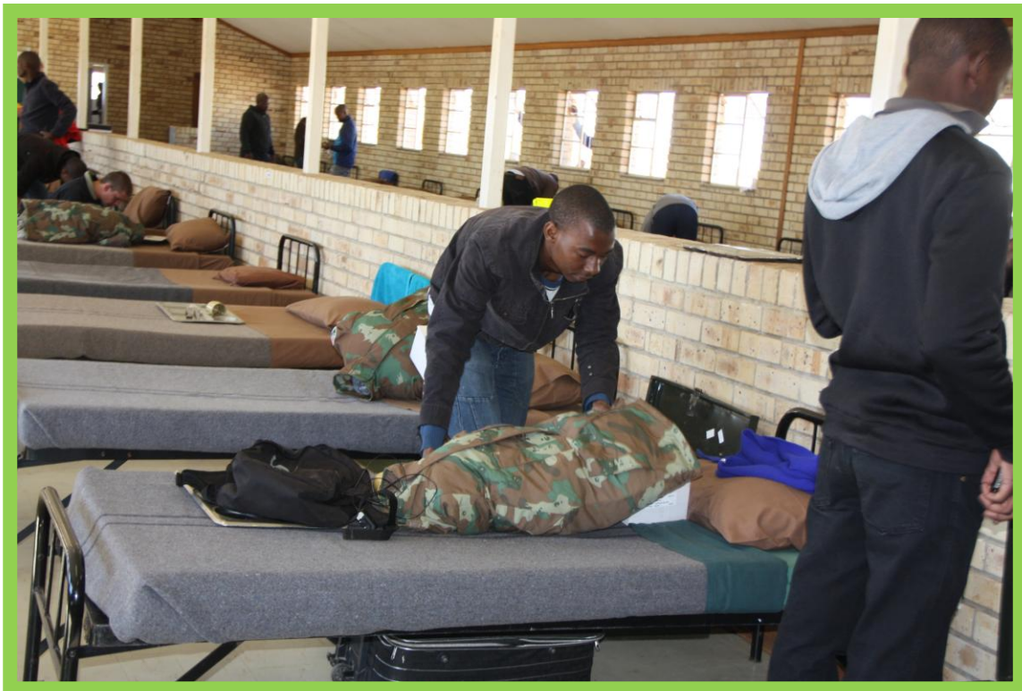
How is this? Not bad for after 2 days? Yet the Instructors might still demand improvement!