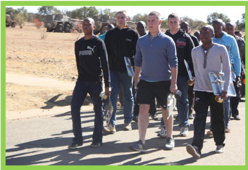
On the move to the mess