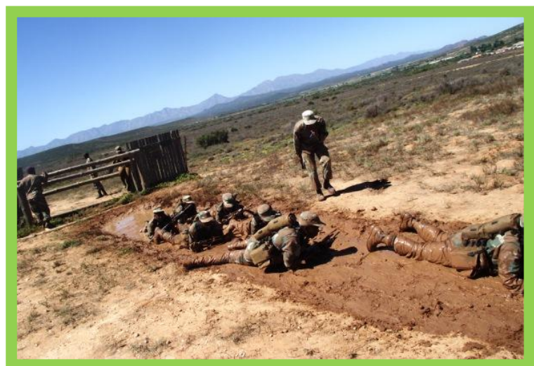
Basic Military Training soldiers working hard during training