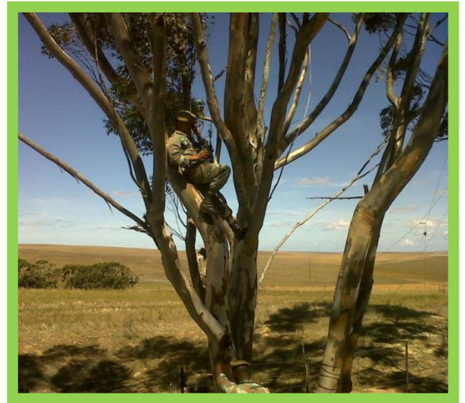
Signallers participating in Exercise “Oor-die-Berg”