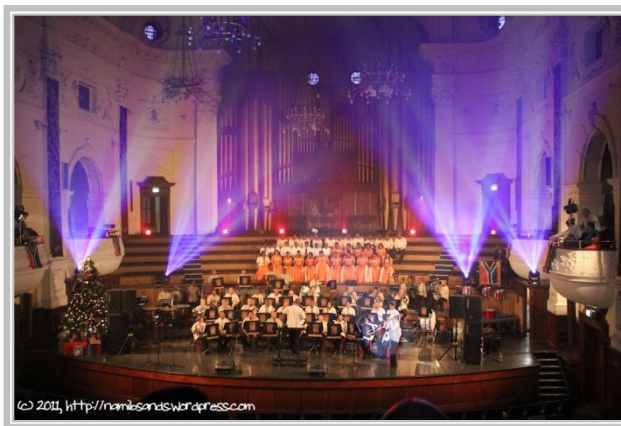
Photo 2: Lance Corporal Sarah Calver plays the demanding solo of Trombone Spagnolo